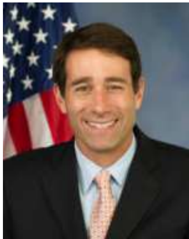
Representative Garret Graves R-LA