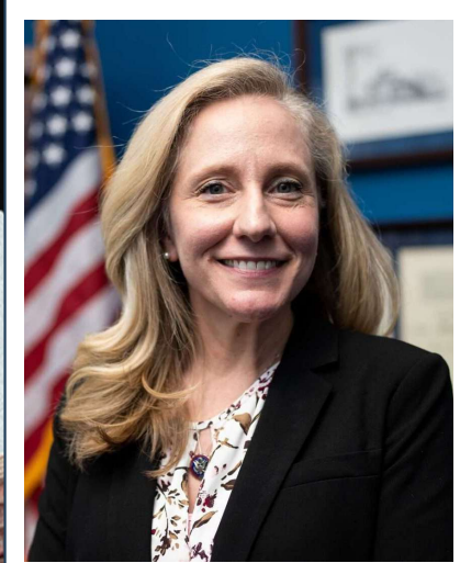
Representative Abigail Spanberger D-VA